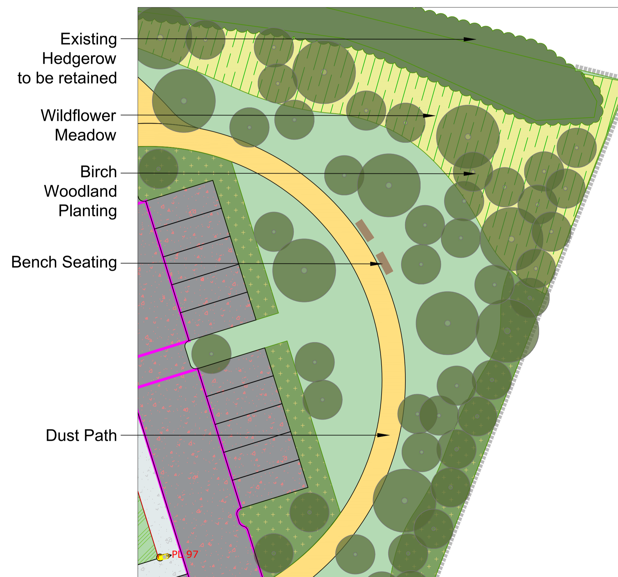
Public Amenity Space - sc. 1:200